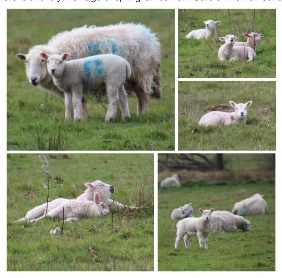
Here is a lovely montage of spring lambs from Carole Thelwall-Jones

Moyra Harkness took this seasonal photo of the wild daffodils behind Highclere Church