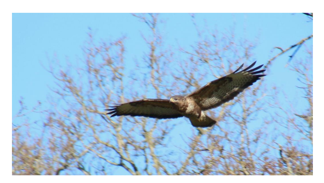
This graceful buzzard was captured by Carole Thelwall-Jones near Woolton Hill