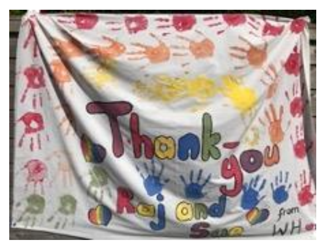
Woolton Hill Junior School produced a rainbow banner to say 'Thank You' to Woolton Hill Stores

Prescription deliveries for both surgeries continued until 6th July when both surgeries re-opened. By this date 22 Neighbourcare volunteer drivers had delivered approximately 4,000 prescriptions travelling roughly 7,000 miles to villages and rural locations – all free of charge, thanks to the financial support we have received from both government groups and the generous local community!