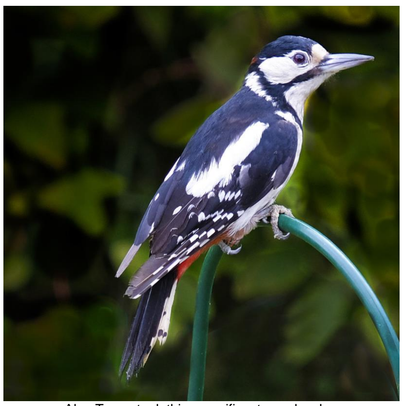
Alan Teece took this magnificent woodpecker

If you are inspired by either of the photos taken of birds below \underline{\mathsf{HERE}} is a beginners guide to birdwatching from the Hampshire Countryside Service.