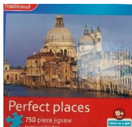
Venice 750 pc