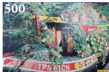
Barge 500 pc

If you would be interested in any of these, please e mail eastwoodhaysociety@gmail.com