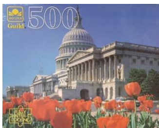
The Capitol 500 pc,

Do you enjoy jigsaw puzzles? East Woodhay Society's nominated Charity, Young People & Children First , is doing its best to support young care leavers through these difficult times. They have been given some jigsaw puzzles, which we are offering for sale, with all proceeds to the charity. We are happy to deliver to local doorsteps for a suggested donation of £3 each. Shown here:-