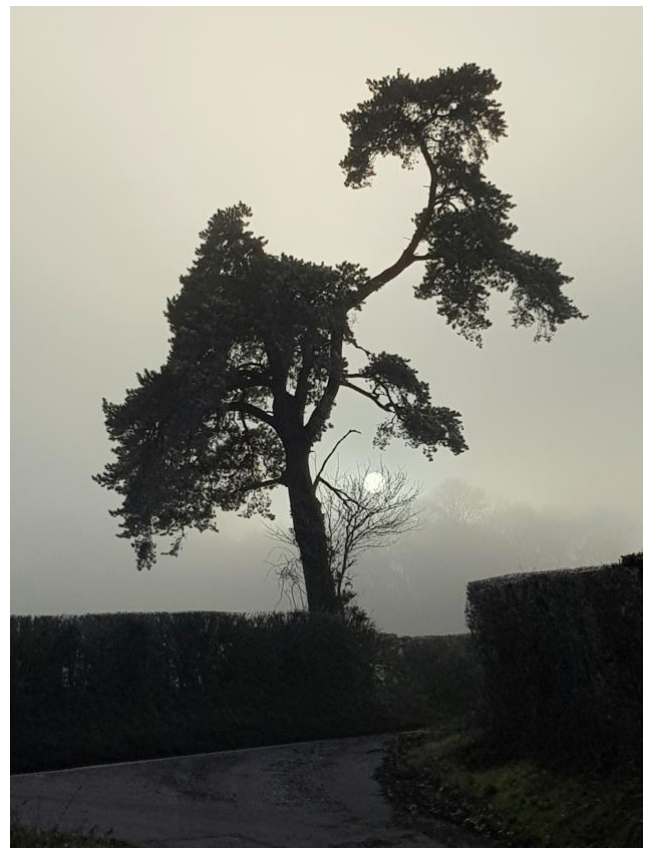
Misty Morning at Hollington

Send us an image – of your favourite local view this winter and we will include it in a future newsletter. Please email to EWCleresNews21@gmail.com